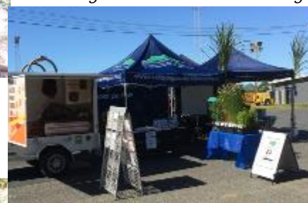
Left: The Pioneer Catchment & Landcare display at the 2015 Ag. Trade. Life Expo.