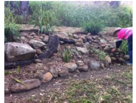
Above: One of the many ornamental rock gardens created by Kerry utilising fallen timber and rocks uncovered on the property.