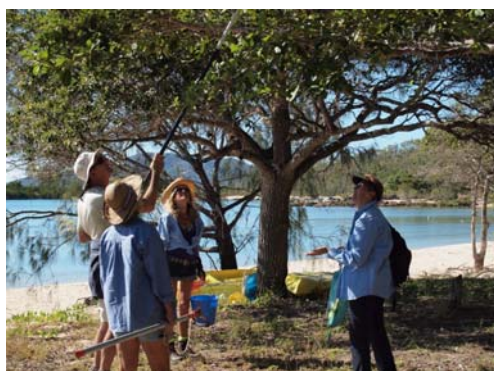
Volunteers collecting seed from Hydeaway Bay.