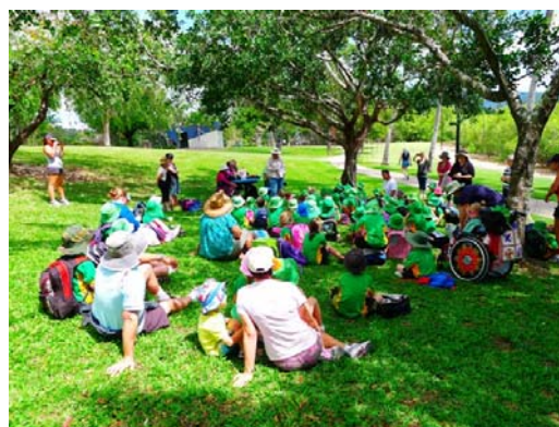
Students from Proserpine State School learning about the different environments in their catchment.