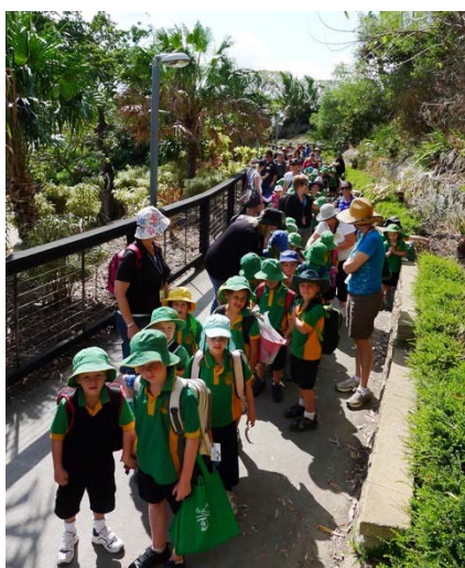
Students from Proserpine State School learning about coastal environments during their walk along the bicentennial walkway.