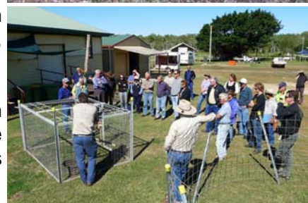
Top: Successful feral pig trapping. Above: Land managers hearing about best practice trapping techniques.