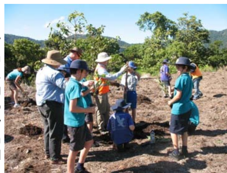
Students participating in the Future Leaders Ecochallenge learning about the value of riparian vegetation and helping plant out the Galbraith Creek site.

Site preparation was carried out after last wet season by Whitsunday Catchment Landcare with assistance from Whitsunday Regional Council for major works. WCL held a number of advertised community tree planting days resulting in 1900 trees planted. Over time these can be used to provide awareness to the community on the value of healthy creek vegetation and bushland. Site maintenance has been carried out by Whitsunday Catchment Landcare and volunteers.