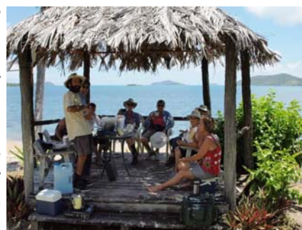
Top: WCL volunteers and CVA participants planting coastal species at Conway Beach. Middle: Volunteers putting the shadecloth on the new shadehouse. Above: WCL volunteers enjoying a lunch break during a seed collecting trip.