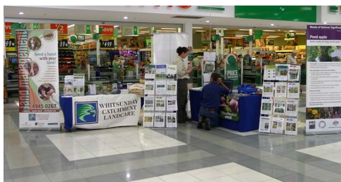
Weedbuster display at Centro Shopping Centre.