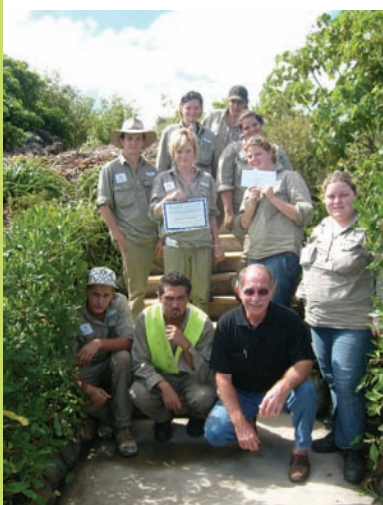
Sarina Green Corps team help out at Captain Blackwood Drive, Sarina Beach