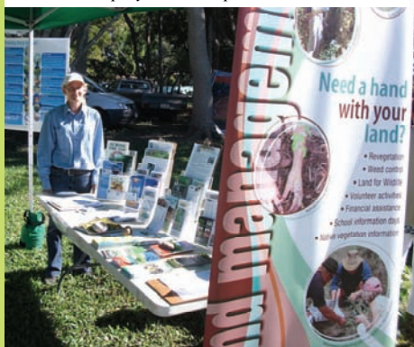
Landcare display at Eco Expo