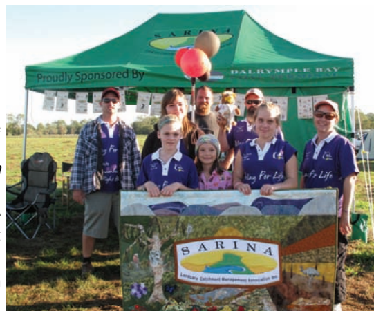
The SLCMA Gum Nut team at the Sarina Relay For Life