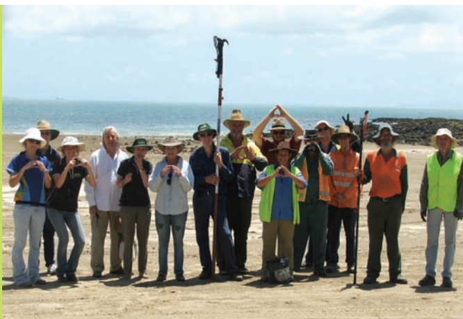
Community volunteers participate in plant identification, beach clean-up and seed collection activities for Coastcare Week