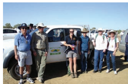
Members of SLCMA, PC&L, WCL at Longreach