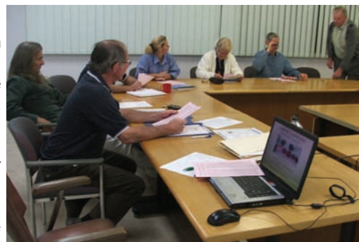
SLCMA holds monthly general meetings