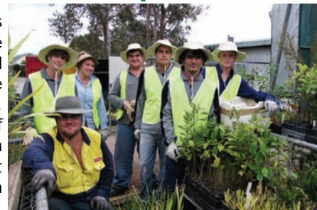
Sarina National Green Corps Team: Mar—Sep 2010

The Australian Government "Green Corps program" was changed this year to the "National Green Jobs Corps Program" and consequently there has been some changes in how the program operates. SLCMA has been fortunate to be a part of both programs, with the last Sarina Green Corps team graduating in August 2009 and the new Sarina National Green Jobs Corps team beginning in March 2010.