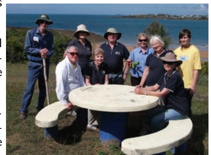
Some of our SLCMA Nursery volunteers!