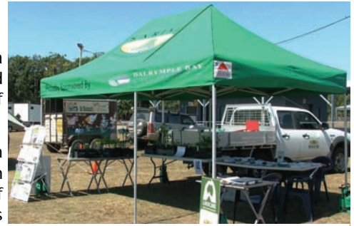
SLCMA display at Coal to Coast Festival

One of our better achievements was conducting the Sarina Native Garden Competition. All entrants received 5 free native plants, donated through the SLCMA Community Native Plant Nursery and the total prize money of $500, was kindly sponsored through the Natural Resource Awareness Grants Program, QLD Government. There are not too many Garden Competitions of this value around.