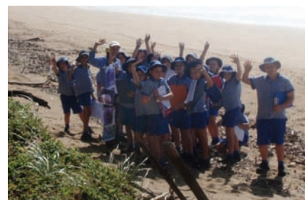
St Annes students learning about our coasts

SLCMA has been fortunate to receive funding from Dalrymple Bay Coal Terminal Management. This will provide future support to local schools and encourage participation in undertaking sustainable environmental practices.