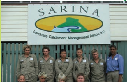
Sarina Green Corps Team: Apr-Aug 2009

The Australian Government "Green Corps program" was changed this year to the "National Green Jobs Corps Program" and consequently there has been some changes in how the program operates. SLCMA has been fortunate to be a part of both programs, with the last Sarina Green Corps team graduating in August 2009 and the new Sarina National Green Jobs Corps team beginning in March 2010.