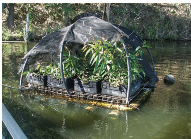
Floating aquaponic unit

Currently located at each of the 3 sites are 2 floating aquaponic units, which were constructed by the Sarina State High School Rural Skills Centre. Vegetation growing on the pontoons includes native Lephostemons , Melaleucas , Callistemon and Lomandra species. The plants were direct seeded by the SLCMA volunteers and their growth and survival rates are included within the monthly monitoring framework. The plants have now reached the required height to begin collection for laboratory analysis of nutrient uptake.