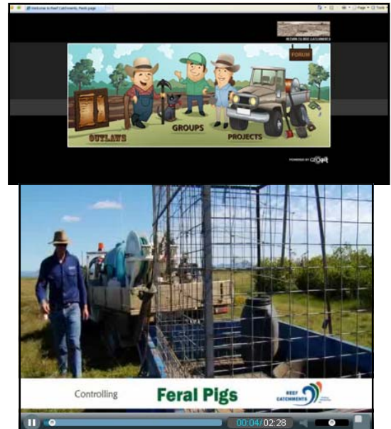
Screen shots from the new, interactive pest website by Reef Catchments.

The website is available now at: www.reefcatchments.com.au if you would like any assistance, please contact PCL.